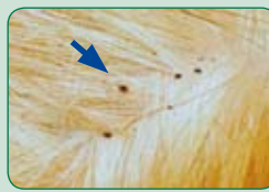
One of the commonest signs of fleas is finding specks of flea "dirt" (flea faeces) in the coat.

can cause serious kidney failure and usually death.