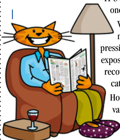
"I can relax – I am!"

However the good news is that there are very effective vaccines against the virus, and your cat can be vaccinated at the same time as the annual health check and other vaccinations. Don't take the risk – please contact us for further information or an appointment!