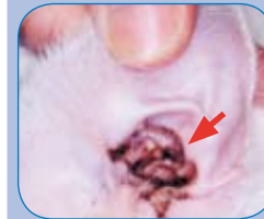
Otitis externa in a cat with ear mites. Note the characteristic crusty brown discharge.

DID you know that ear disease is a fairly common problem, affecting pets of all ages? Whilst the ear is a very complex structure, most of the ear problems seen in pets involve disease of the external ear canal. Disease of this area is called otitis externa (also termed canker ). Symptoms, which can be gradual or sudden in onset, include head shaking, ear rubbing, reddening of the skin lining the external ear canal, and frequently a discharge (as seen in the case below).